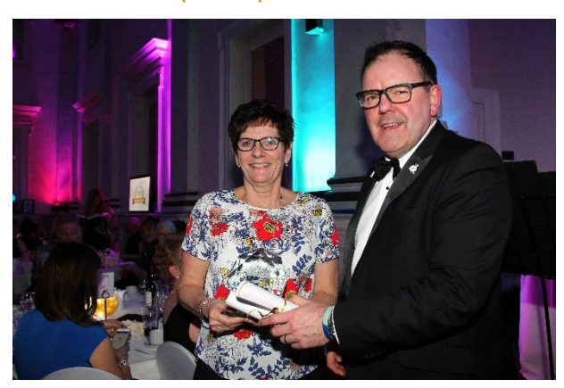
Care Leadership Award